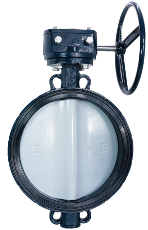
HB950-G/O 14" - 32"

Wafer Style, Pin-Free Valve Shaft, Seal-Line Seat Design to BS5155 and MSS SP-67 Flange Dimension to EN1092-2, ANSI B16.1 Class 125